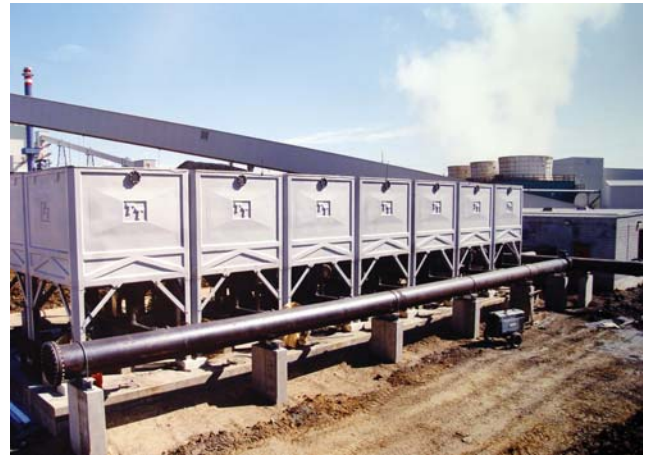
An early Modular Cooling Tower constructed of hand-laid-up fiberglass

Early in the year Tower Tech's research and development team itemized every problem inherent to cooling towers in general, as well as the company's own fleet of wheeled units. They determined that side air intake louvers had to be eliminated in order to improve thermal performance and make it possible for large numbers of towers to be co-located without seriously impairing thermal performance. A new breed of water distribution nozzle had to be invented so a cooling tower could operate clog-free with even the worst water quality. Also, a new tower design would have to provide for easier and safer access to the tower's mechanical equipment, and offer greater redundancy and reliability. Tower construction would have to be sturdy enough to withstand several relocations each year. Faster connections were needed to minimize field labor. Finally, a 'new generation' cooling tower should have an elevated water basin to allow cooled water to gravity feed over long distances without the need for additional pumping.