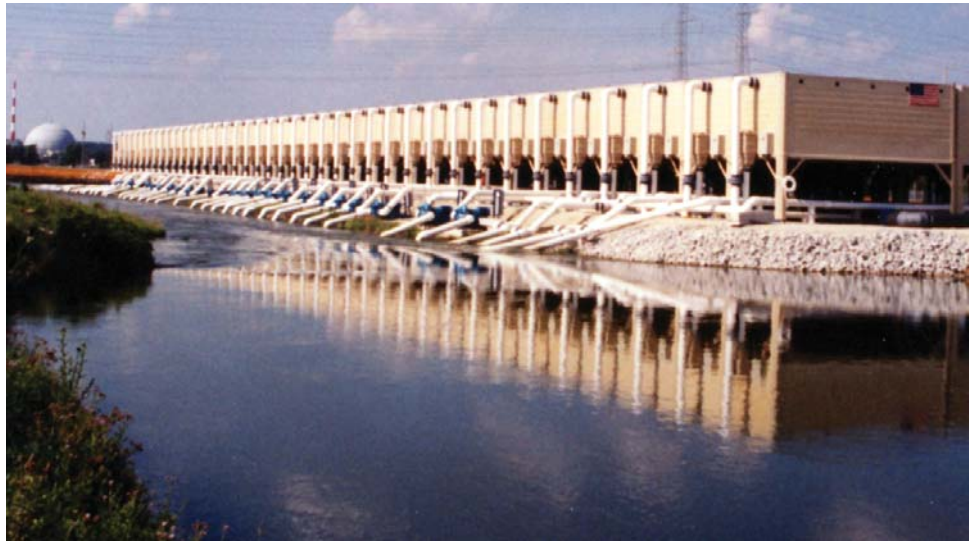
Modular Cooling Towers reducing thermal pollution for ComEd

Our customer partners enjoy a culture of quality shaping an industry. The TTXL Modular Cooling Tower received CTI certification for thermal performance in the summer of 2008, and is also certified for both seismic and wind load bearing. Its modular design is ideally suited to any temporary application. Tower Tech is the proud manufacturer of the world's largest fleet of temporary cooling towers. We have sold more than $150 million of permanent towers worldwide. Our team of cooling tower experts is committed to the success of each customer's project and gives no-nonsense advice and sound answers to any cooling tower need.