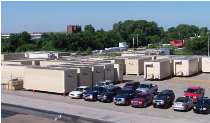
Modular Cooling Towers inventoried for immediate shipment