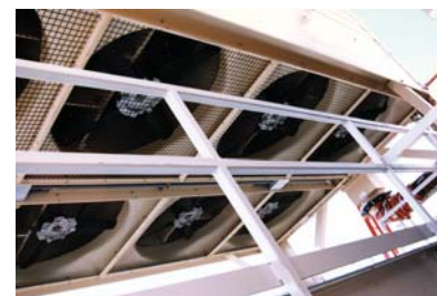
Modular Cooling Tower with bottom mounted mechanical equipment

Standby cooling for critical processes is a key use for temporary cooling towers. Tower Tech temporary cooling towers are used to back up critical manufacturing and chemical processes, or when a hospital's required system redundancy has been reduced. The temporary cooling tower may not be in use, but it is there when it is required.